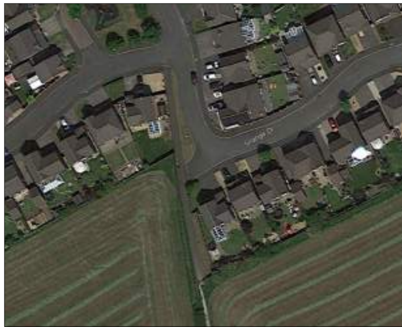
NORTH SOUTH AERIAL VIEW